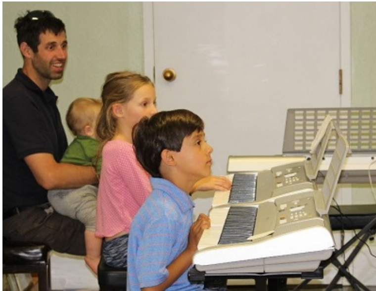
CCM VIRTUAL OPEN HOUSE

friends, and neighbors so you can all be part of the CCM community.