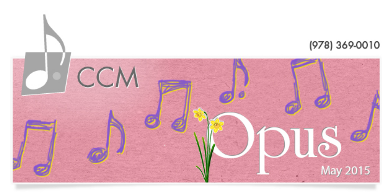
The Concord Conservatory of Music